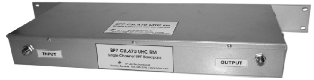
BP7-ch.# UHC Rack Mount Dim: 1.75" x 19" x 6.5" (1 RU)

Ex 2: BP7-CH.668-674 UHC B50 - ch.47, BNC 50 ohms ports