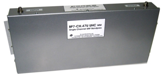
BP7-ch.# UHC Wall Mount Dim: 6.5" x 17" x 1.75"